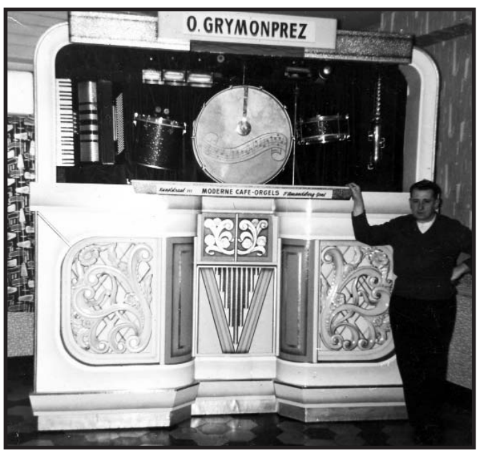
Figure 5 (above) and 6 (below). Two then modern café-orchestrions, delivered by Oscar Grymonprez in 1961. The instrument above was owned by J. Sagt in Dussen (N.-Br.); the orchestrion below was located in the café of Mr.Cremers in Wilderen.