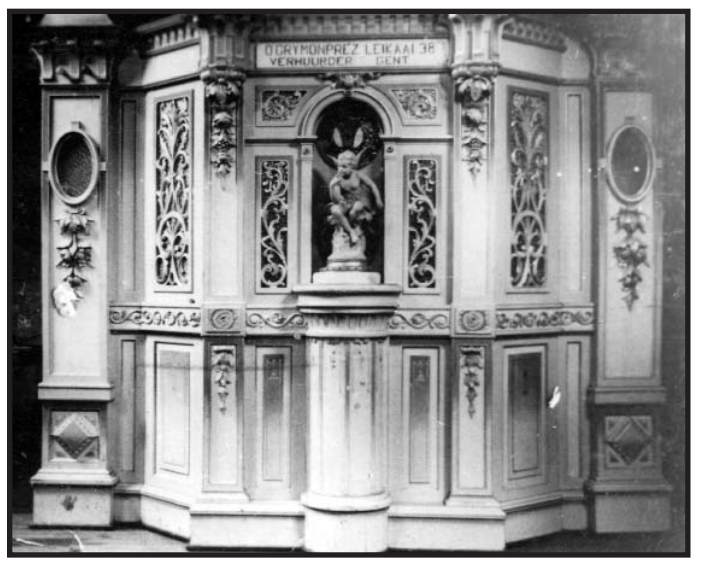
Figure 7. Originally an 84-key Mortier orchestrion rebuilt by the Grymonprez firm.

In his article in October 1960, Leonard Grymonprez writes that at that moment, they had already traded about 160 organs, amongst which "certainly some hundred Mortier organs." The number of traded organs would increase even more in the 1960s.